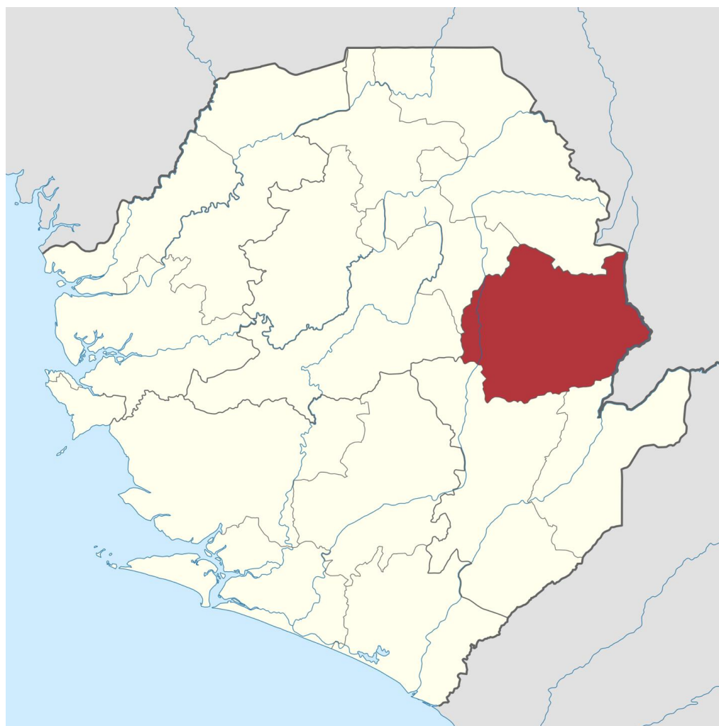
Figure 1: Kono District, Sierra Leone